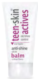
Anti-shine Skin Balm

A purifying moisturiser to gently aid in clearing the skin while you sleep. This botanical rich formulation soothes irritation and purifies impurities, helping to reduce the occurrence of future breakouts.