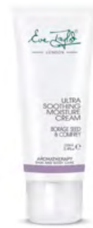
Ultra Soothing Moisture Cream

A refreshing spritz-based toner with extracts of Elderberry and Linden Blossom to soothe and strengthen reddened skin, whilst increasing hydration and maintaining moisture.