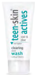
Clearing Face Wash

Teen-Skin Actives offers a natural, no fuss solution to balance and maintain skin during teenage years. This easy to use range helps to establish a good skincare routine, preparing the skin for the future.