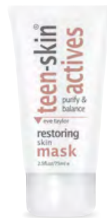
Restoring Skin Mask