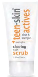
Clearing Skin Scrub

This fast working treatment gel combats the causes of breakouts. A powerful synergy of Tea Tree, Lavender, Lemongrass and Allantoin provides purifying properties, while soothing redness and reducing breakout irritation.