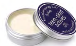
Moisturising Lip Balm SPF10

A deeply purifying mask to absorb excess skin oils and lift impurities which lead to blocked pores and blackheads. Hydrating action leaves the skin feeling moisturised, fresh and clarified.