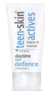
Daytime Skin Defence SPF15

A gentle yet effective scrub to combat unsightly blackheads and blocked skin pores. Natural Bamboo beads thoroughly exfoliate the surface skin layers for a clearer more energised appearance.