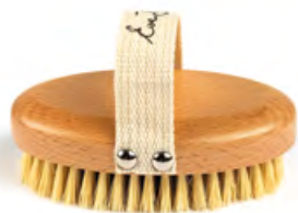
Dry Body Brush

A spa experience in the comfort of your home