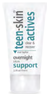
Overnight Skin Support

A non-drying lotion based toner, packed with botanicals to help eliminate impurities, reduce oil secretions and prepare the skin ready for moisturiser. Leaves the skin hydrated and refreshed.